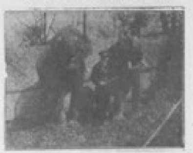
"The fluct-flucting Elephonic." For pottern in the king better stophone "Long" with ten review "Counts, Engls Com". "The Bennan productor," this very original act will be with Entle Posting Comm.