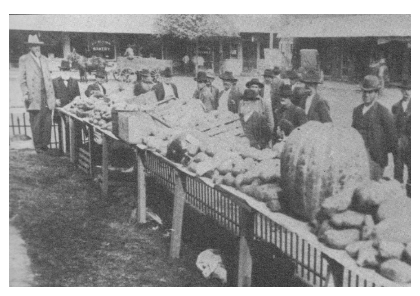
One of the early Fairs held on the Public Square in Lawrenceburg.

In 1914, while the Leoma Fair was drawing large crowds and hosting a variety of events, a separate, more-modest "corn and pumpkin show" consisting solely of agricultural displays had begun on the Square in Lawrenceburg. In 1916, the Fair Association decided not to hold the popular event in Leoma, and the Lawrenceburg fair took over as the county's main event.